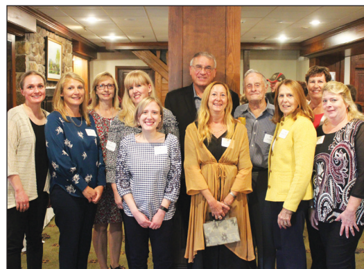
Hope Springs' Board of Directors was well represented at Celebrate Hope 2018.