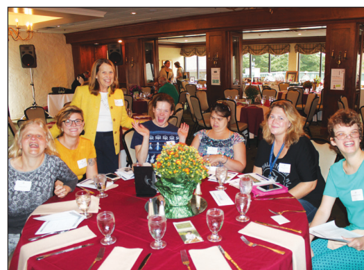
We LOVED having so many of our students at Celebrate Hope!