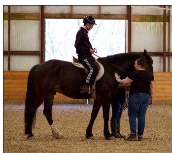
Peace by Piece's indoor ring is helping Hope Springs to continue lessons in inclement weather.

"IT'S ALL ABOUT THE RIDERS AND THEIR NEEDS AND ABOUT THE PARENTS, LOVED ONES, VOLUNTEERS AND STAFF THAT SUPPORT THEIR CHILDREN, RELATIVES AND FRIENDS."