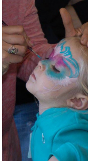
Beautiful work by Crazy Faces Face Painting

We are looking forward to our annual fundraiser, Hopes and Dreams, which will be held on Sunday, October 9th from 11:00 a.m. to 3:00 p.m. at the Whitford Country Club in Exton, PA. All proceeds from this family-friendly brunch event directly benefit the riders of Hope Springs.