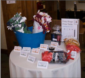
At Pony Bingo, Hope Springs shared facts about the organization while supporters won prizes.